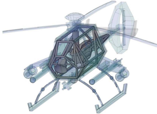
Fig. 2. View of the UAS Albatros, SAR version