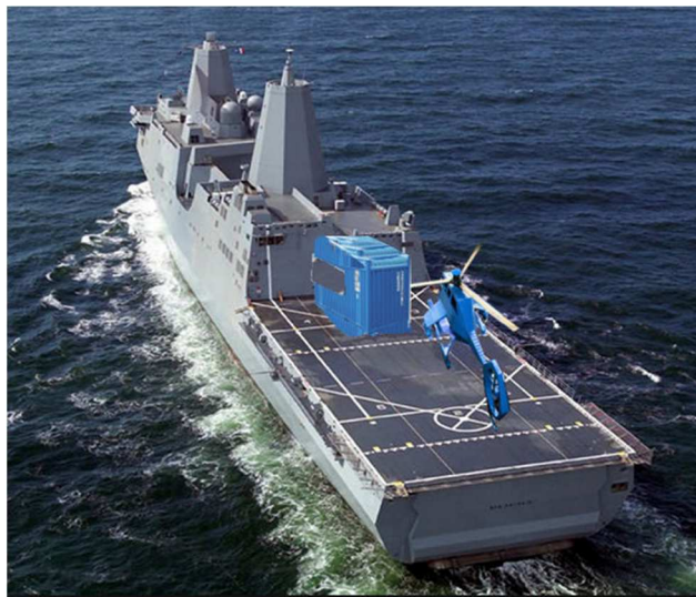
Fig. 1. View of UAS Albatros approach to landing aboard a ship